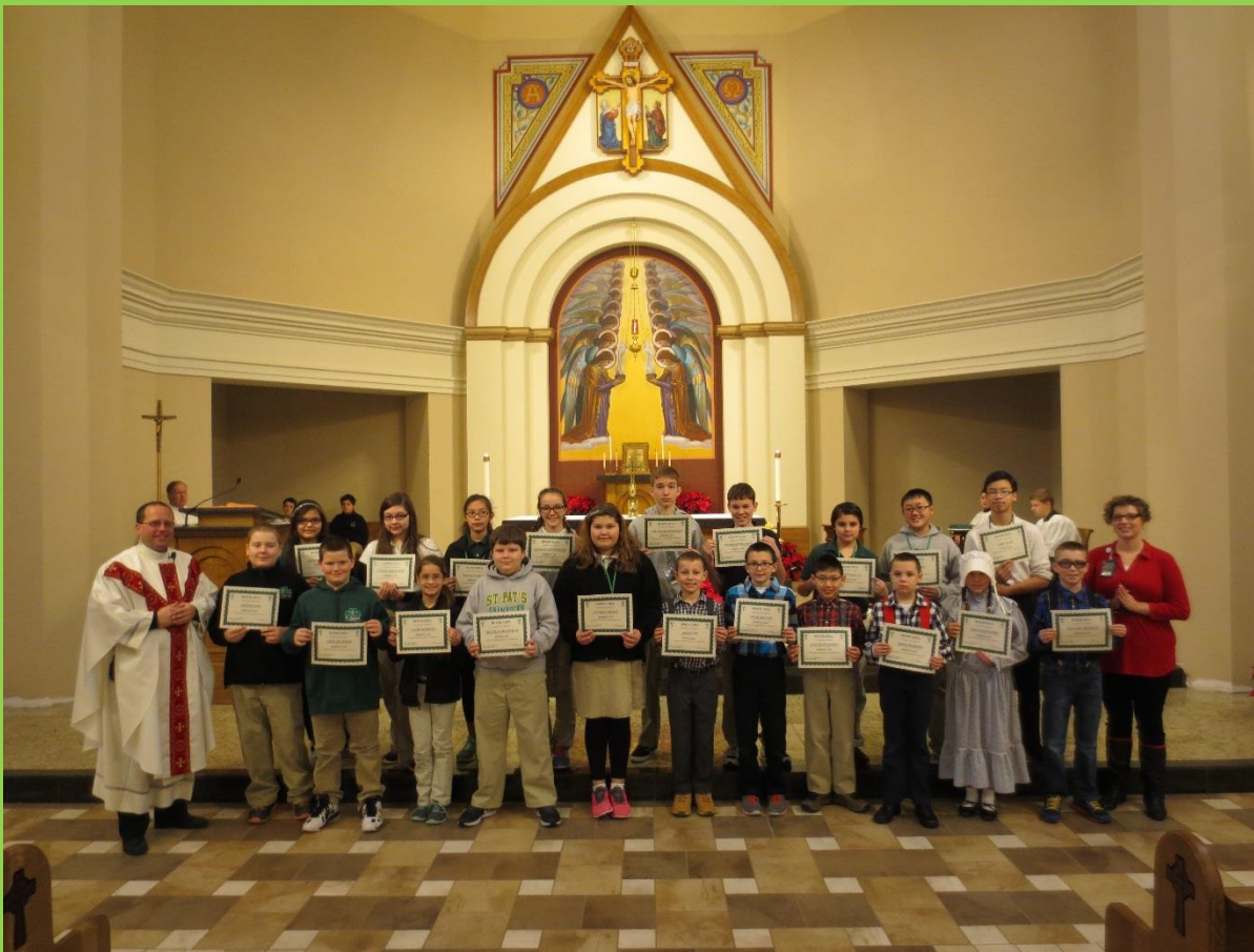
2 nd Quarter Honor Roll