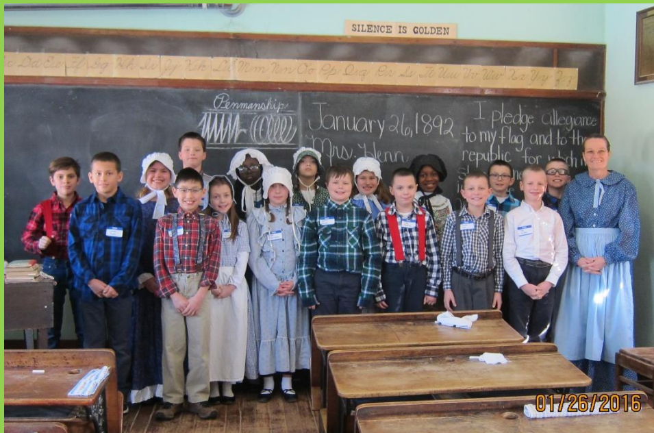
4 th grade goes to heritage school