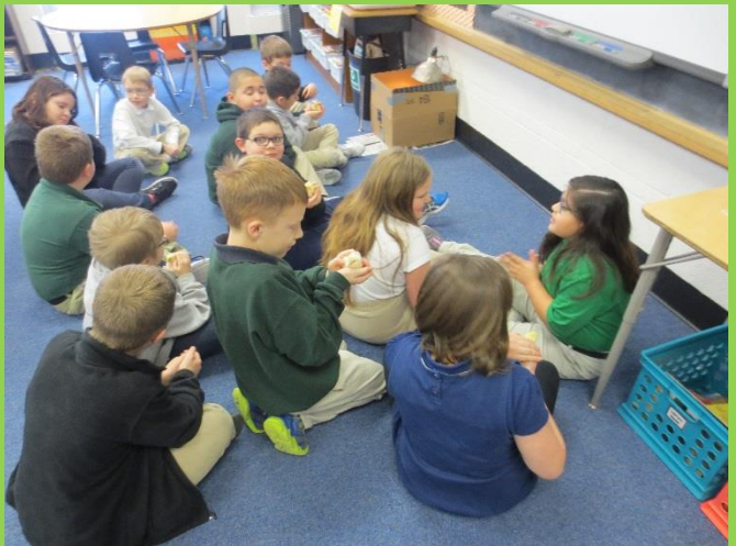
3 rd grade enjoyed their chicks after they hatched this week