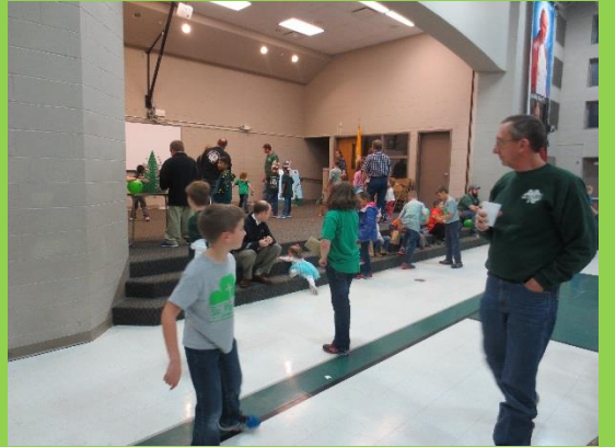
Celebration and Soup Supper pictures