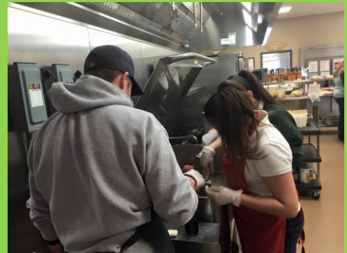
8 th graders serving and cooking at Matt Talbot Kitchen