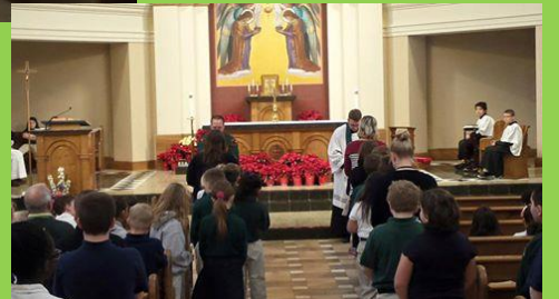
Blessing of Throats: Feast of St. Blaze