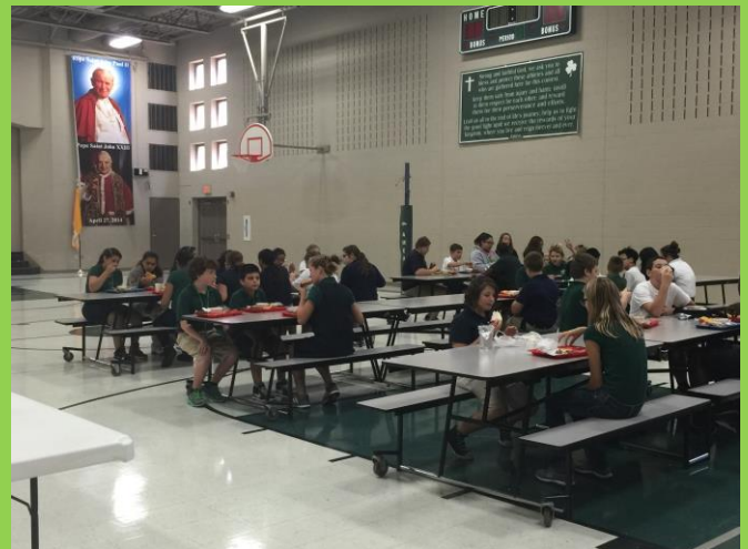
6 th , 7 th , and 8 th Grade LUNCH