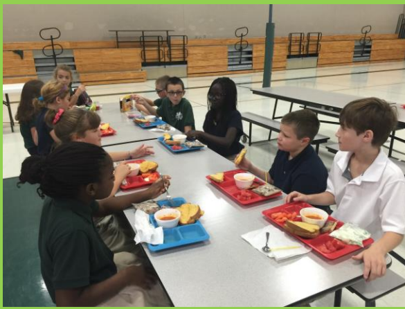
3 rd , 4 th , and 5 th Grade LUNCH